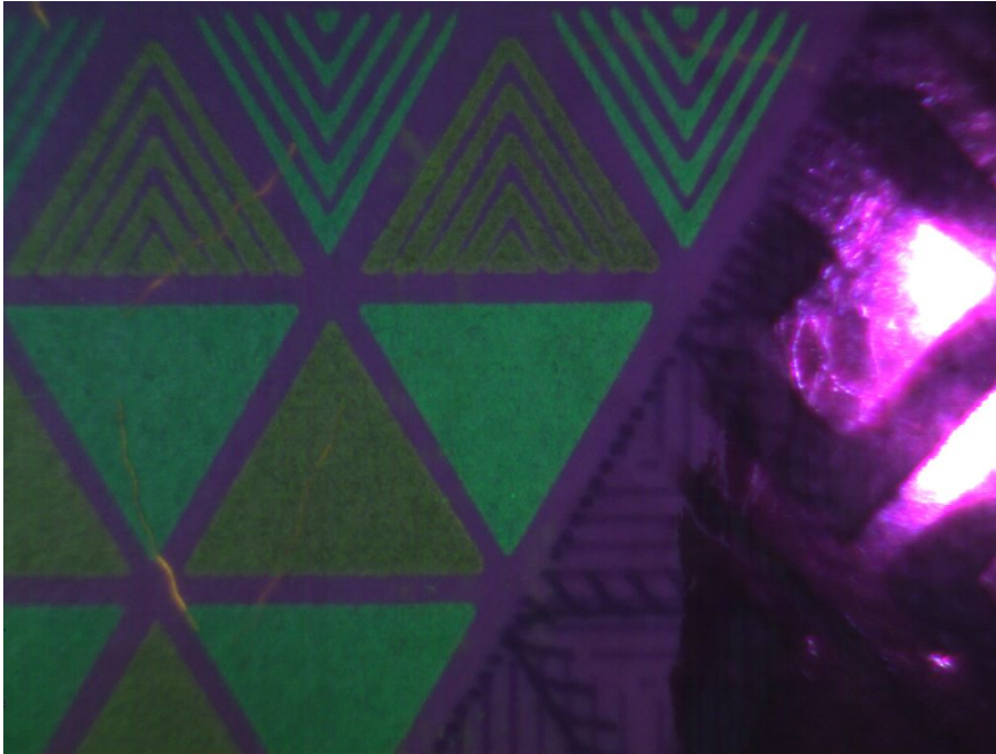
Spectral luminescent magnifier Regula 4177: Ultraviolet top light (365 nm) 1x