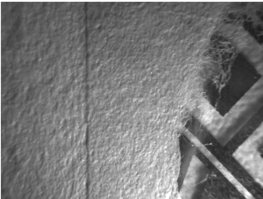
Spectral luminescent magnifier Regula 4177: Infrared oblique light (880 nm) 1x