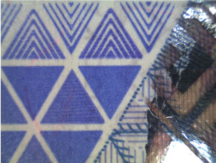
Spectral luminescent magnifier Regula 4177: White top light 1x