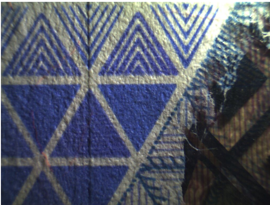
Spectral luminescent magnifier Regula 4177: White oblique light 1x